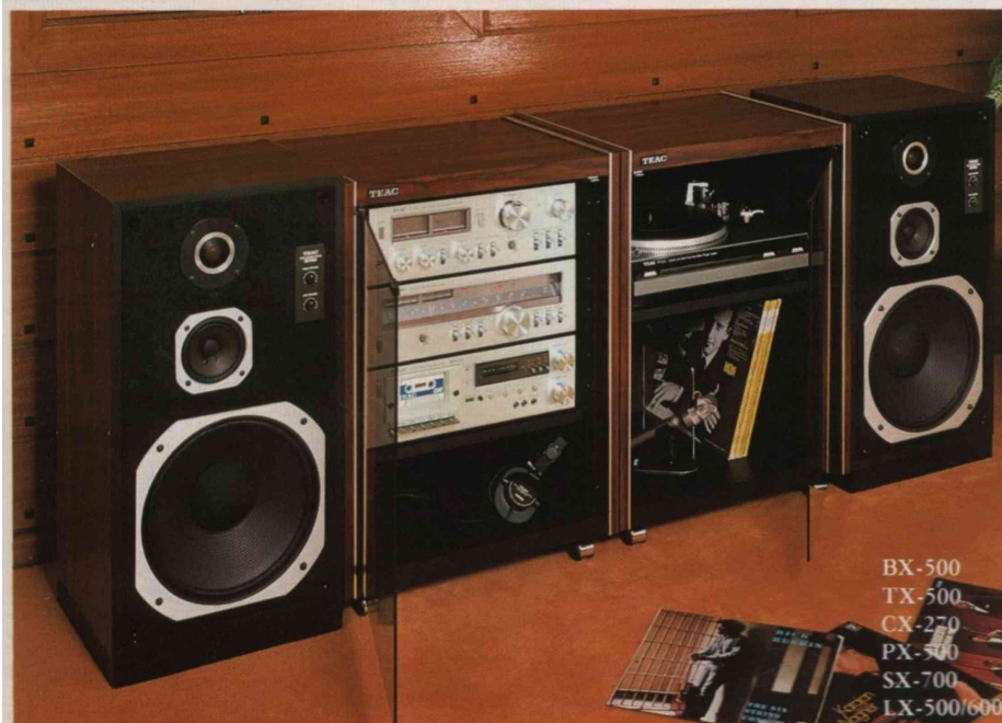
BX-500 TX-500 CX-270 PX-500 SX-700 LX-500/600

This system offers top performance, and a combination of power and economy that's perfect for any home. Since these components are specifically designed for use as a system, matching between them is precise—both electrically and aesthetically. You get great looks and great sound with exceptionally low overall distortion. Put it all together in our LX-350 component rack and you have a well-organized package of superb musical entertainment.