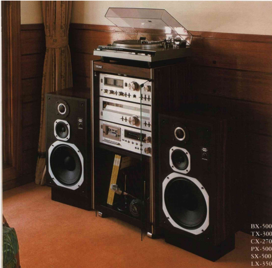
BX-500 TX-300 CX-270 PX-500 SX-500 LX-350