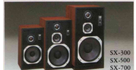
SX-300 SX-500 SX-700

all critically designed to transform mechanical motion into sound without adding any resonance or distortion. And the all important crossover networks are precision-engineered for maximum transition smoothness between drivers with minimum loss and distortion.