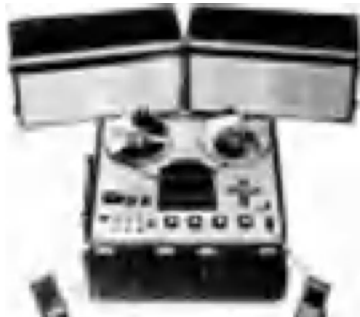
MR 929 Mk II

MR 939 Outstanding stereo tape recorder. 4 track. 3 speed. 7 »»lt per channel. Signal to noise ratio 4SdB. Erase 65 dB. With accessories About 89 *ns.