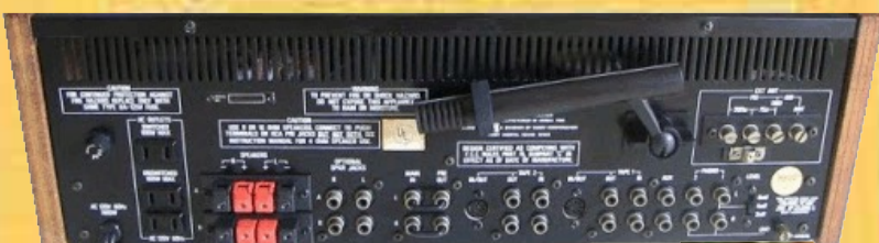
Wide array of input/output jacks—proof of the 2100's unmatched versatility

AMPLIFIER. Frequency Response: 15-20,000 Hz ±2 dB at 10 watts. Intermodulation Distortion: 0.05% at 70 watts. Signal-to-Noise Ratio: 70 dB (phono), 75 dB (aux). Phono Input Overload: 200 millivolts. FM TUNER. Sensitivity (IHF): 1.6 microvolts (10:1 dB). Capture Ratio: 1.5 dB. Alternate Channel Rejection: 70 dB. RF Interference Rejection: Rated excellent. Stereo Separation: 52 dB at 1 kHz. Total Harmonic Distortion: 0.1% stereo; 0.05% mono. Signal-to-Noise Ratio: 70 dB. AM TUNER. Sensitivity: 200 microvolts per meter for 20 dB S+N. Image Rejection: 60 dB. Signal-to-Noise: 45 dB. POWER REQUIREMENT. 120VAC, 60 Hz. SIZE: 67x207x167x