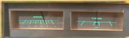
AM signal strength and FM center-channel meters