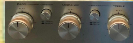
Selectable crossover points for bass and treble response